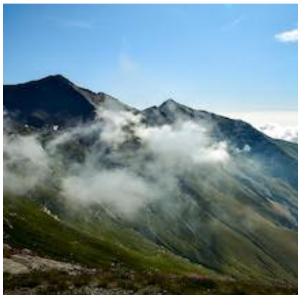
Euromontana develops guide to include mountains in programming