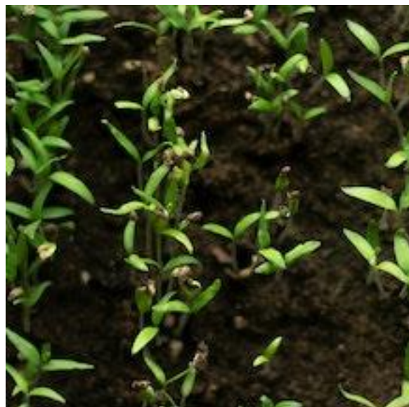
Publication provides guidance on Alpine soil ecosystem services